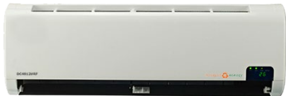
Wall Mount Indoor Unit (IDU)

12,000 BTU 48V DC Heat Pump VRF Dynamic Capacity Compressor 100% DC - No Inverter