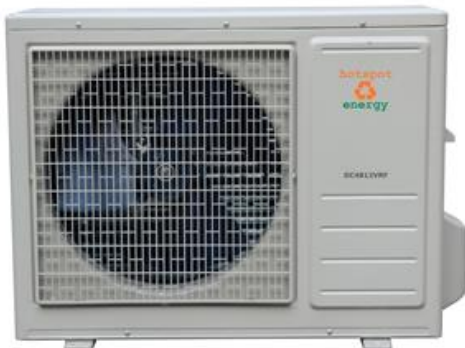
ODU (Outdoor Unit)

Variable Refrigerant Flow & Capacity means that the air conditioner is always the right size for the conditions and is never wasting power.