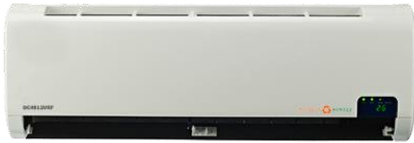
Wall Mount Indoor Unit (IDU)

12,000 BTU 48V DC Heat Pump VRF Dynamic Capacity Compressor 100% DC - No Inverter